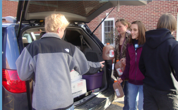
PYF loading up the car to take food to Good News Community Kitchen to serve.

Meet at the Church at 3:30 Pm return to the Church at 6:15.