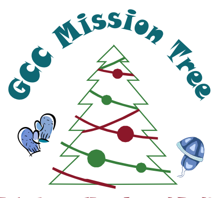
Help Warm Hearts and Bodies with the GCC Mission Tree Collection December 13 and 20.

Thank you from Chapter 20 of the GCC Women's Association and the Missions Outreach Board.